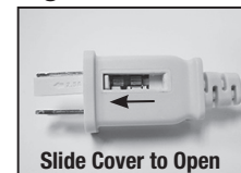
Slide Cover to Open