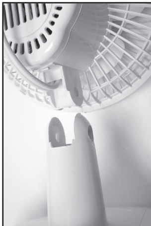
Place Clip Base on to Fan